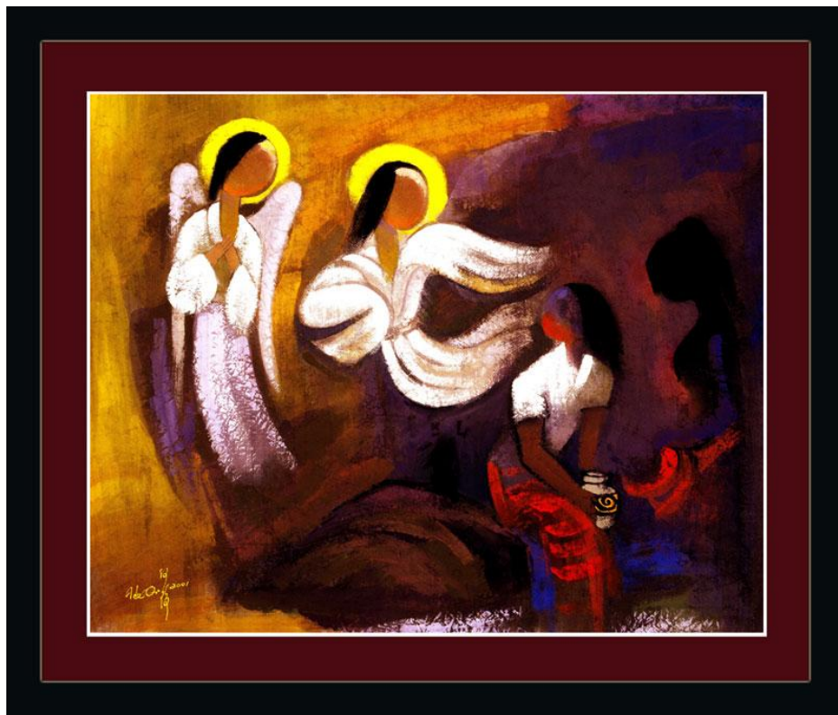
He Qi: Resurrection