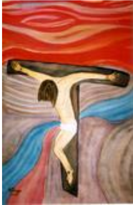
Magrit Prigge: Surely