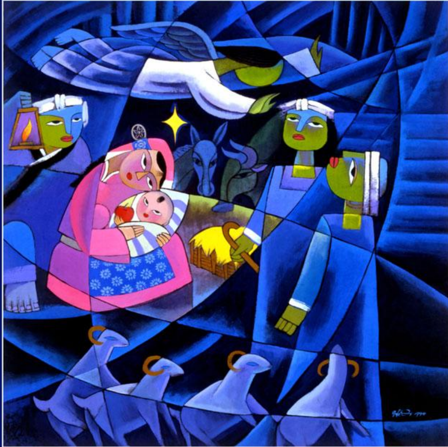
Nativity by He Qi

December 24, 2009 The Nativity of Our Lord Jesus Christ 5:00 p.m.