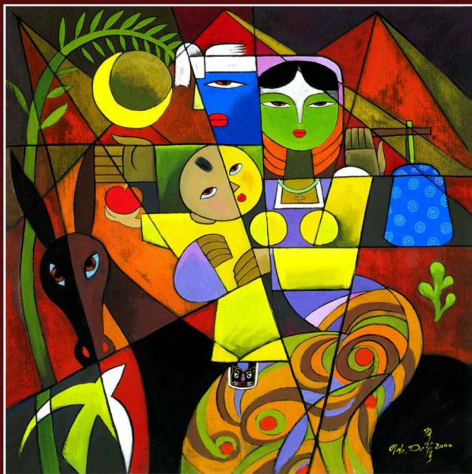
Flight into Egypt by He Qi

January 4, 2009 The Second Sunday after Christmas Day 11:00 a.m.