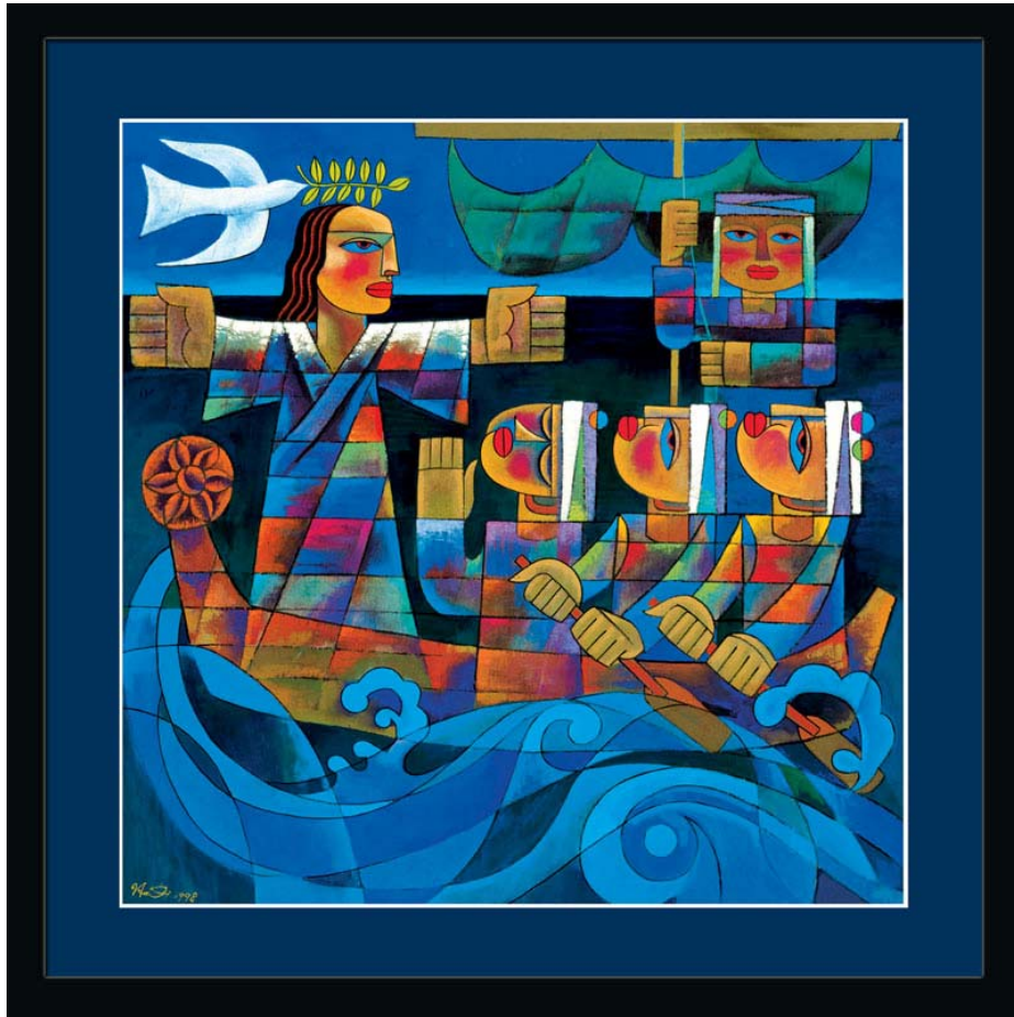
Peace Be Still: He Qi

June 21, 2009 The Third Sunday After Pentecost (Proper 7) 11:00 a.m.