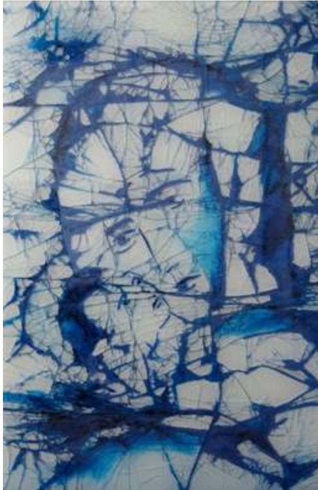
True Blue , by Yorgos Papadopoulos

November 28, 2010 First Sunday of Advent 11:00 a.m.