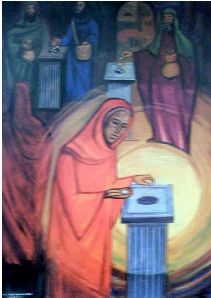
The Widow's Mite

November 8, 2009 Twenty-third Sunday after Pentecost – Proper 27 11:00 a.m.