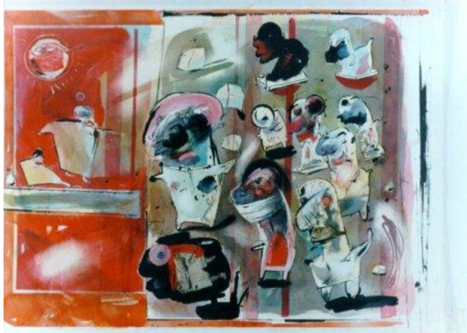
(The Ten Lepers Cleansed)

The Twentieth Sunday after Pentecost (Proper 23 C) October 14, 2007 9:00 a.m. and 11:00 a.m.