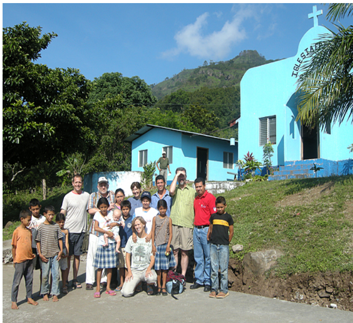
Washington D.C. group and San Mateo parishioners on their new grain-drying patio.