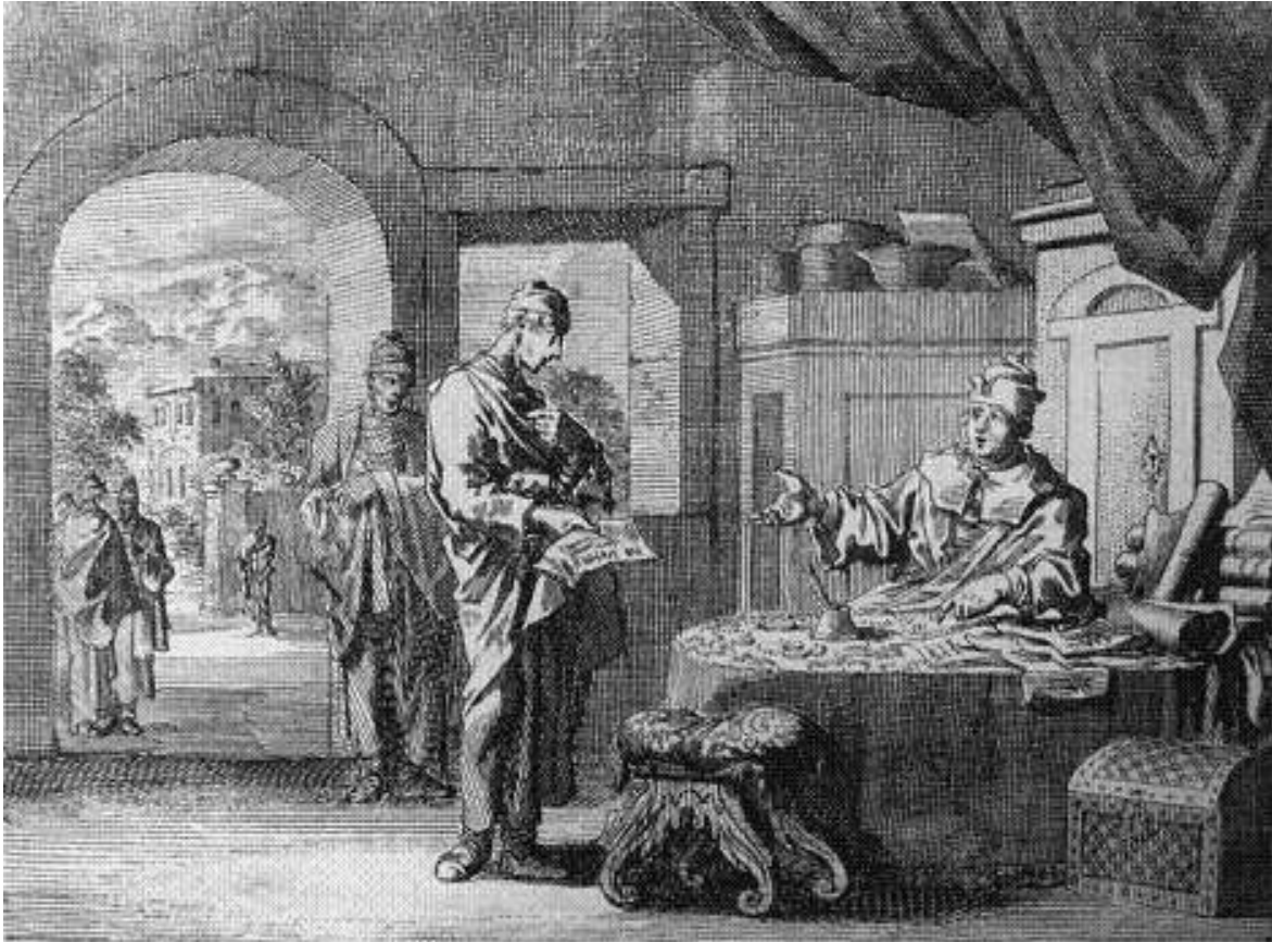
Parable of the Unjust Steward, by Jan Luyken

September 19, 2010 Seventeenth Sunday after Pentecost 11:00 a.m.