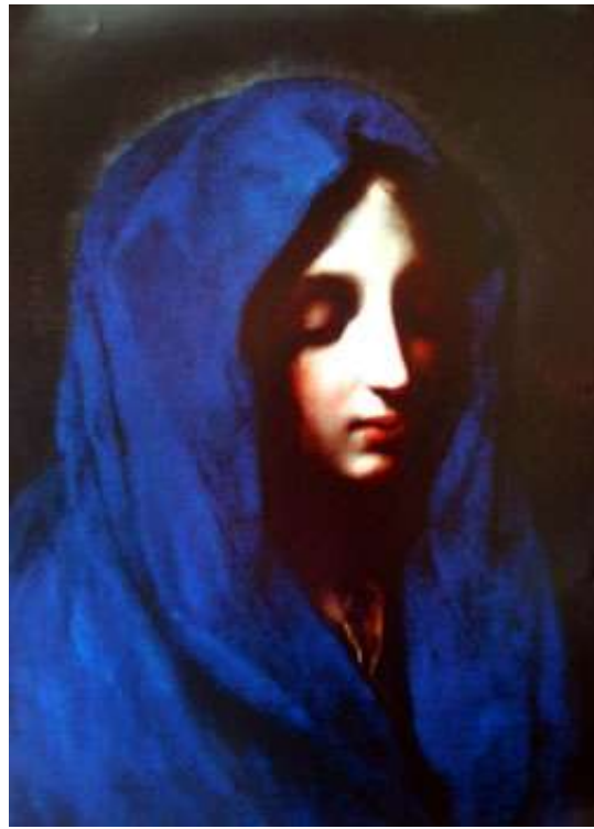
Blue Madonna , by Carlo Dolci, 17 th c.

Taizé Prayer and Holy Eucharist Advent 2010